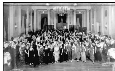
Members of the first Soroptimist club, SI of Alameda County, with their guests celebrating the club's 3rd anniversary in 1924.

At the beginning of the 1920's, women in North America had established themselves in the political arena through suffrage and in the professional world as a result of World War 1. The time was right for women actively engaged in professions and careers to come together for mutual support and friendship and to serve the communities to which they belonged. The time was right for Soroptimist.