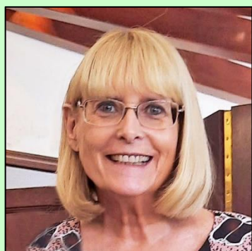
EDITOR Pam Bradford

DEADLINE Submit articles and photos by the 25th of each month to Pam at: