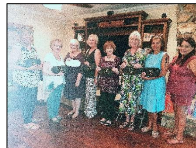
2023-24 SIR Board of Directors (Sorry, the photo was damaged.)