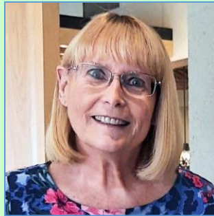
EDITOR Pam Bradford

DEADLINE Submit articles and photos by the 25th of each month to Pam at: pambradford@pamsemail.net