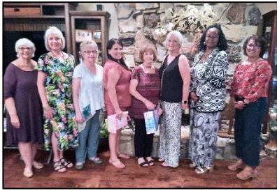
2024-25 Board of Directors