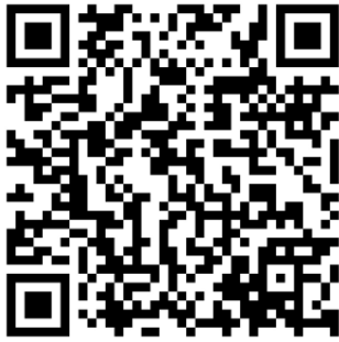
QR Code to Purchase Tickets For SI Riverside's Comedy Night