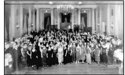
Members of the first Soroptimist club, SI of Alameda County, with their guests celebrating the club's 3rd anniversary in 1924.

At the beginning of the 1920's, women in North America had established themselves in the political arena through suffrage and in the professional world as a result of World War 1. The time was right for women actively engaged in professions and careers to come together for mutual support and friendship and to serve the communities to which they belonged. The time was right for Soroptimist.