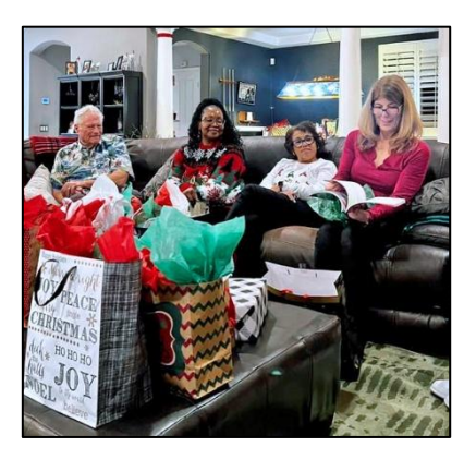
Donated Toys for Arlington Temporary Assistance